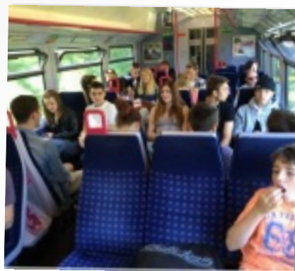
TRAIN TO LONDON