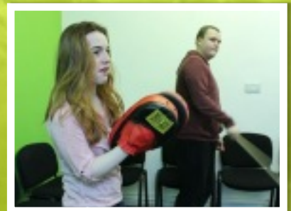
STAGE SOUNDS & LIGHTS