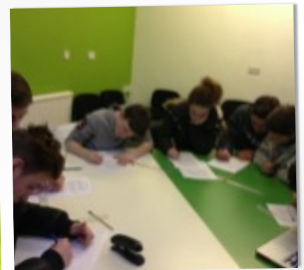
SKILLED FOR LIFE