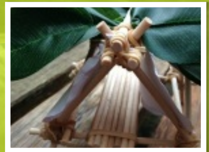
SURVIVAL IN THE WILD